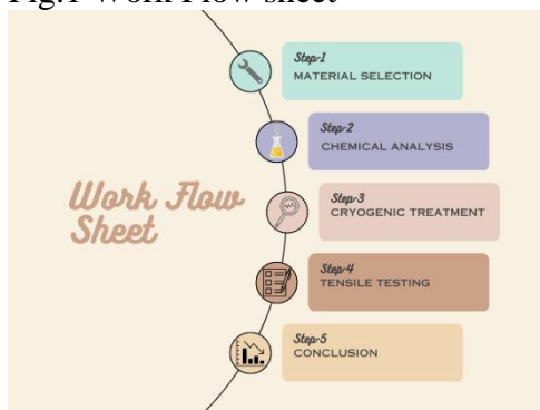
Fig.1 Work Flow sheet

First the materials which are needed to be treated are selected according to the experiment. Then these materials are undergone for chemical composition. Later the materials are tested by Traditional heat treatment and Deep cryogenic treatment. After completion of both the tests these materials are put to Mechanical testing i.e., tensile test, where these test results are compared. Later keeping these results to consideration we draw conclusions and the benefits of cryogenic treatment.